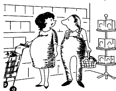
BBB... "Well, I'm due in two weeks. And you?"

Any pregnant women living in the Donnington area can attend, (even if you don't have a voucher) and there is no need to book, you can just turn up. The Bump Club runs from 9.30am to 11.30am every Thursday. Please call the Health Promotion team on 01952 686 310 for more details.