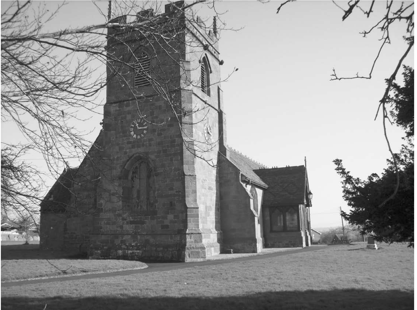
St Michael's Church