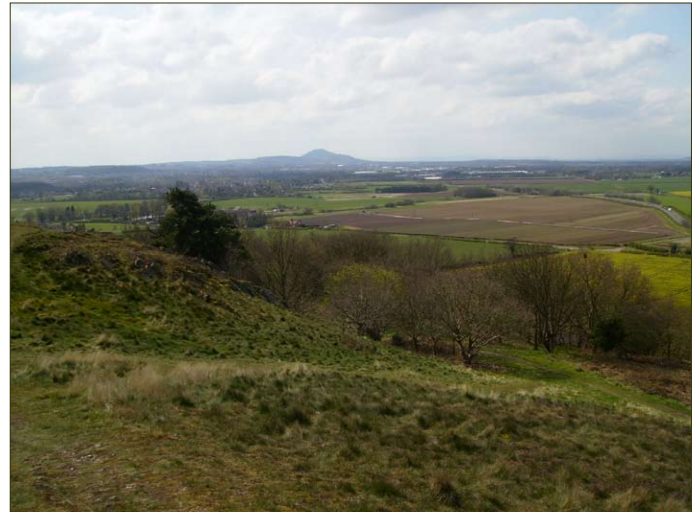
View of the Parish from Lilleshall Monument