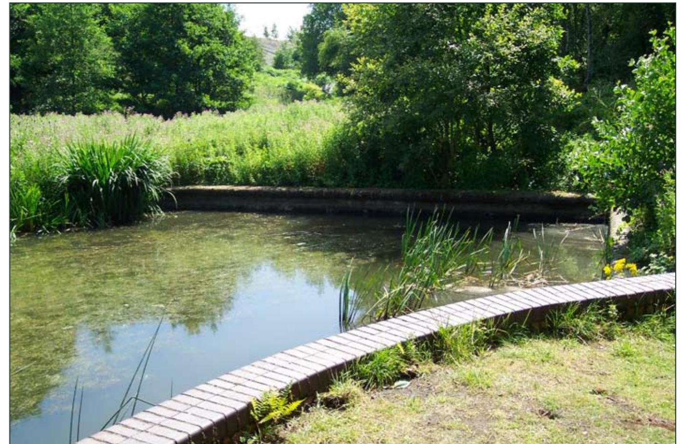
Canal Basin, Granville Country Park